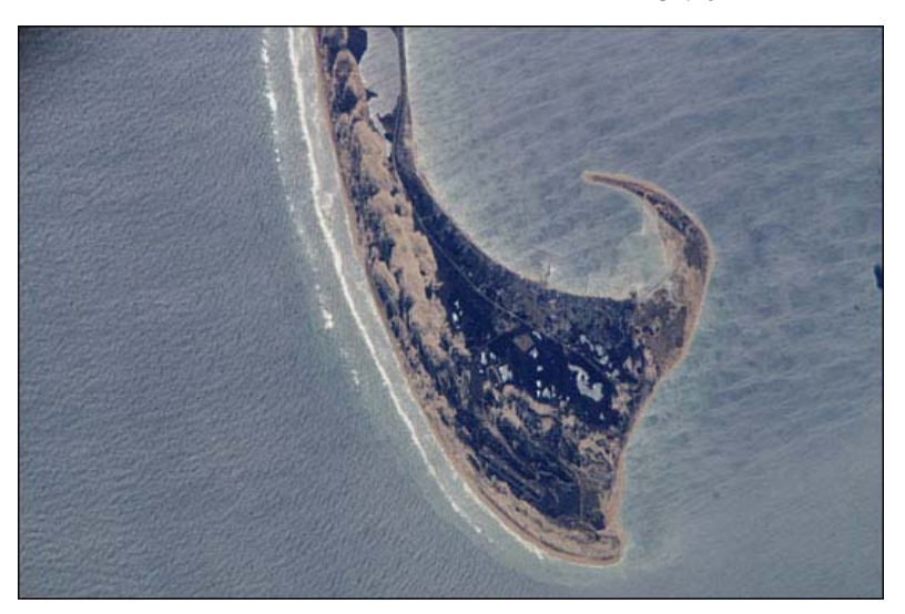
The northernmost parts of the Cape Cod National Seashore, Massachusetts, are featured in this image. Wave refraction patterns are present near the edge of the Cape (bottom), and coastal dune fields are visible at image center. Astronaut photograph ISS010-E-21965 was acquired March 30, 2005, with a Kodak 760C digital camera with an 800 mm lens.