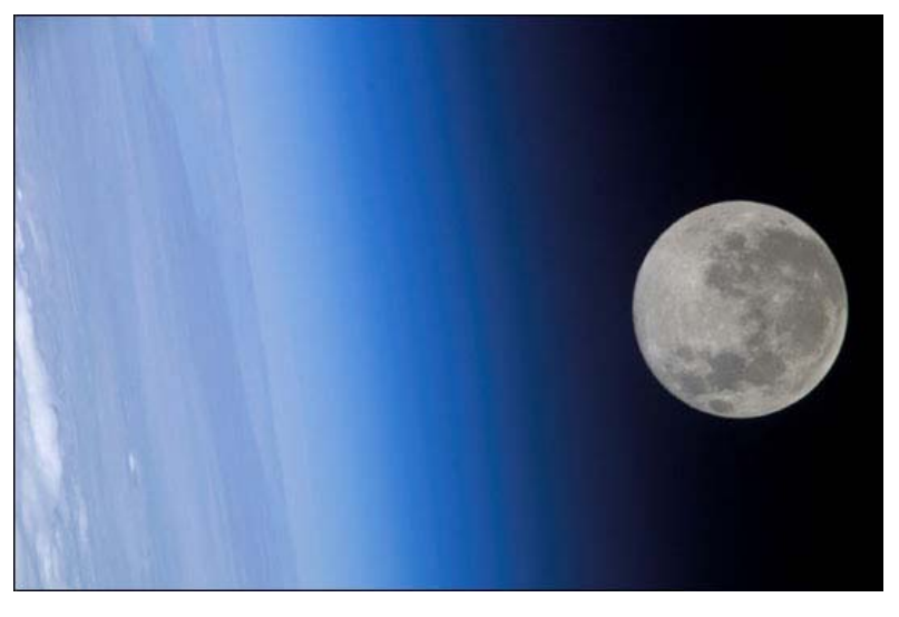
A full moon is visible in this view above Earth's atmospheric limb. Astronaut photograph ISS010-E-18583 was acquired February 24, 2005, with a Kodak 760C digital camera with an 800 mm lens.

High-resolution image (466 KB JPEG)