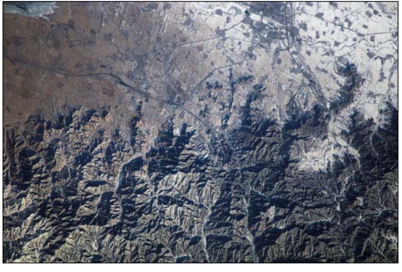
The Great Wall of China and Inner Mongolia are featured in this image. Snow cover and shadows helped to positively identify the position of the Great Wall. Astronaut photograph ISS010-E-18338 was acquired February 20, 2005, with a Kodak 760C digital camera with a 400 mm lens.