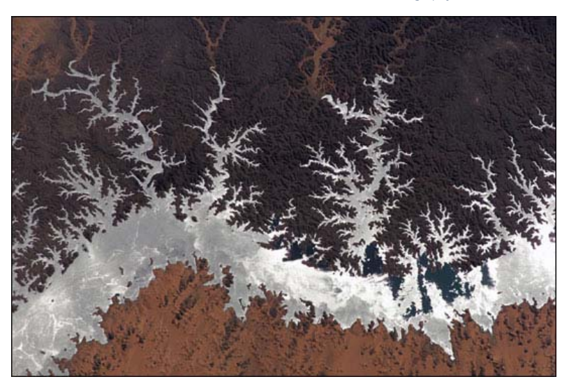
Egypt's Lake Nasser was created by completion of the Aswan High Dam in 1970. Sunglint (light reflected off the water surface) on the lake makes it easily visible. Astronaut photograph ISS010-E-14618 was acquired January 23, 2005, with a Kodak 760C digital camera with a 400 mm lens.