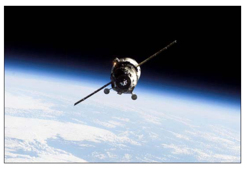
High-resolution image (1.2 MB JPEG)