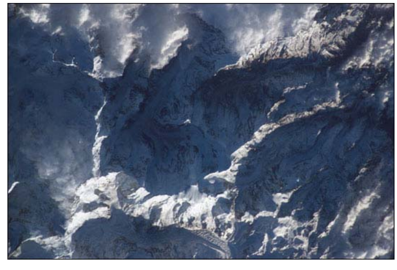
A portion of the Himalaya range and several glaciers are featured in this image. Astronaut photograph ISS010-E-15457 was acquired February 1, 2005, with a Kodak 760C digital camera with a 400 mm lens