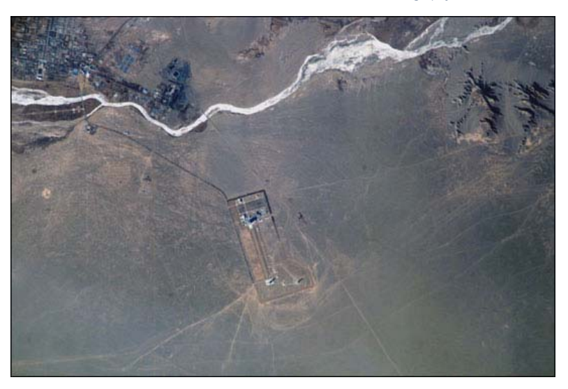
The image depicts the spacecraft launch complex at Jiuquan, China. Astronaut photograph ISS010-E-14586 was acquired January 23, 2005, with a Kodak 760C digital camera with an 800 mm lens.