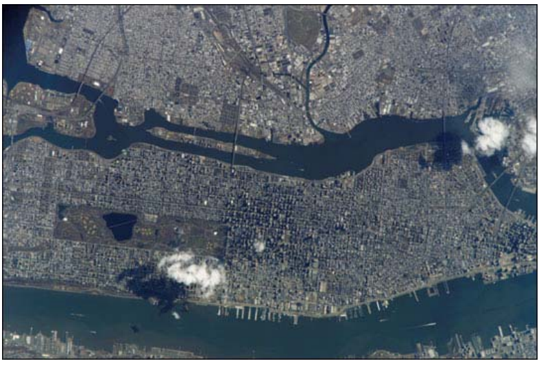
Manhattan Island and its easily recognizable Central Park (center left) are featured in this image. Some of the other New York City boroughs (including parts of Queens and Brooklyn) are also shown, as are two small sections of the New Jersey side of the Hudson River (lower left and lower right). Astronaut photograph ISS010-E-21487 was acquired March 26, 2005, with a Kodak 760C digital camera with an 800 mm lens.

Two of the world's great cities, New York and Beijing, were among those imaged by Leroy Chiao during Expedition 10. Large urban centers such as these serve as global economic, social, and cultural centers. The establishment and growth of cities also alters local and sometimes regional climate patterns, hydrology, and ecology. Replacement of existing soil and vegetation by asphalt and concrete fosters the creation of urban "heat islands," increases surface water runoff, decreases groundwater recharge, and fragments pre-existing ecosystems.